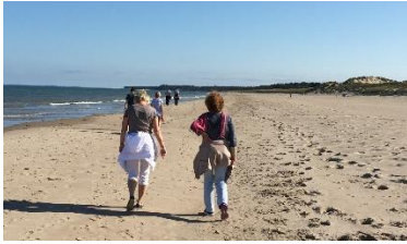
A broad, fine, sandy beach at the Irish Sea (Kilmuckridge) is only 28 miles from Kildavin