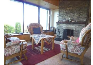
Living room with open fireplace