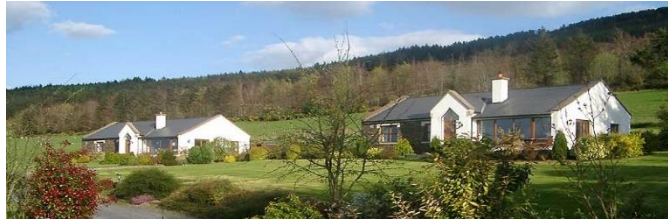
Mt. Leinster Cottages: Haus Klara 1109 sqft, 3 bedrooms; Haus Miriam 915 sqft, 2 bedrooms