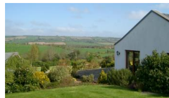
Fascinating look to the valley