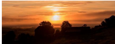
Sunrise view from bedroom of Haus Klara