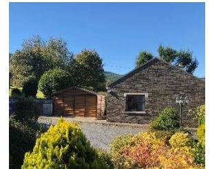
Driveway to both cottages and parking space for 5 vehicles